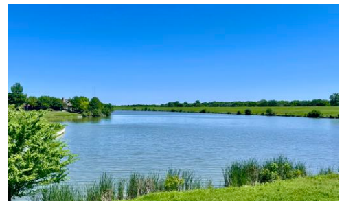
Lake View from the Valley Ranch Paths