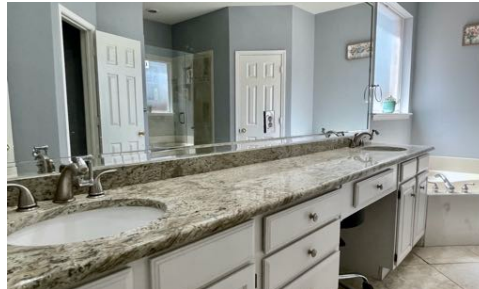
Spacious Primary Bathroom