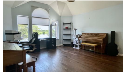
Upstairs Second Living Area