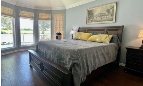
LARGE Primary Suite with Amazing Views