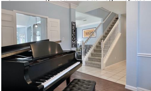
Optional Formal Dining or Study/Piano