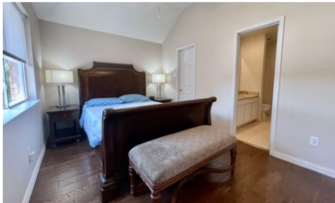
Upstairs Second Primary/Bedroom #2