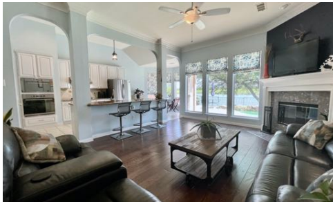
OPEN Living Area with Gas Log Fireplace