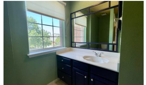
Full Bathroom #3