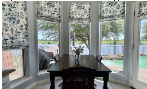
Scenic Breakfast Area