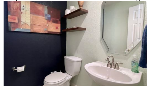
Downstairs Half Bathroom