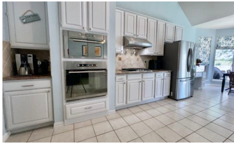
Updated Kitchen with Stainless Appliances