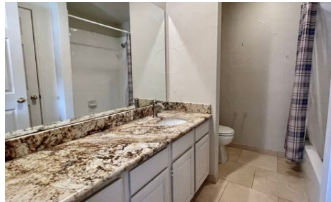
EnSuite Bathroom to Bedroom #2