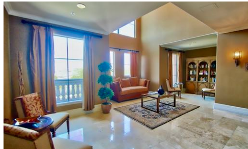
3rd Floor Library Area