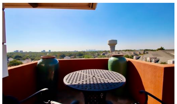
Skyline Terrace Views of Downtown Dallas

The information contained herein is furnished by the owner to the best of his/her knowledge, but is subject to verification by the purchaser, and agent assumes no responsibility for the correctness thereof. The sale offering is made subject to errors, omissions, change of price, prior sale, or withdrawal without notice. In accordance with the Law, this property is offered without respect to race, color, creed, national origin, sex, familial status or disability. This is not intended to solicit property currently listed. All information to be verified by Purchaser prior to closing.