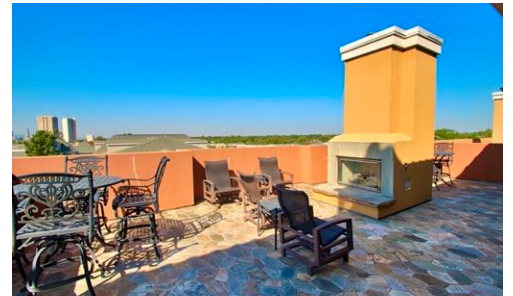
5th Floor Skyline Terrace with Fireplace