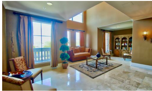
3rd Floor Library Area