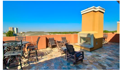
5th Floor Skyline Terrace with Fireplace