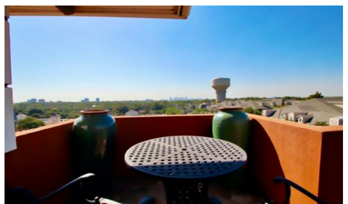
Skyline Terrace Views of Downtown Dallas

The information contained herein is furnished by the owner to the best of his/her knowledge, but is subject to verification by the purchaser, and agent assumes no responsibility for the correctness thereof. The sale offering is made subject to errors, omissions, change of price, prior sale, or withdrawal without notice. In accordance with the Law, this property is offered without respect to race, color, creed, national origin, sex, familial status or disability. This is not intended to solicit property currently listed. All information to be verified by Purchaser prior to closing.