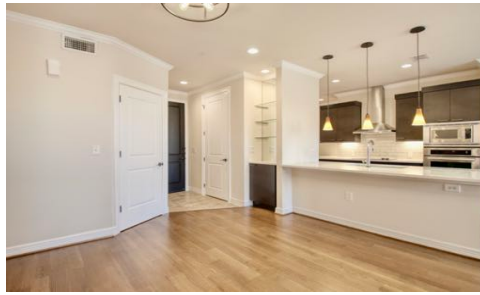
Dining Area with Kitchen Bar & Half Bath