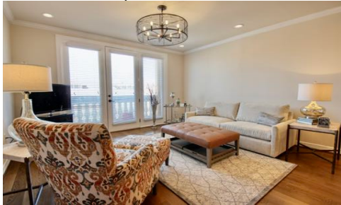
Spacious Living with Balcony