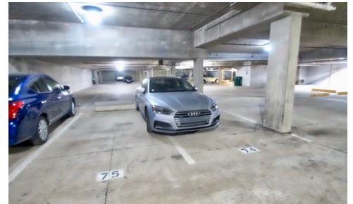
Parking B74 & B75