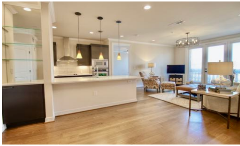
Open Floor Plan