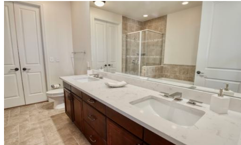
Primary Bathroom with Dual Vanities