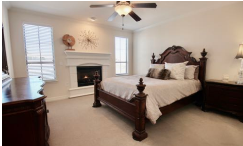
Primary Suite with Gas Auto Fireplace