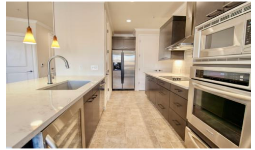
Gorgeous Open Kitchen