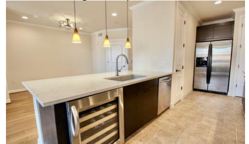
Utility Closet in Kitchen Nook