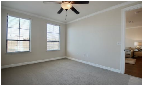
Secondary Bedroom Suite