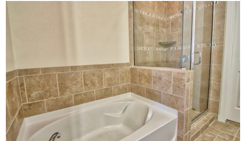
Primary Soaking Tub & Separate Shower