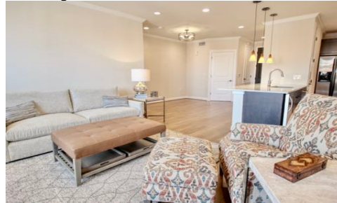
Living & Dining Areas