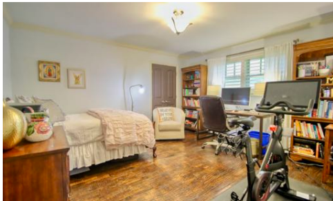
Spacious Split 4th Bedroom