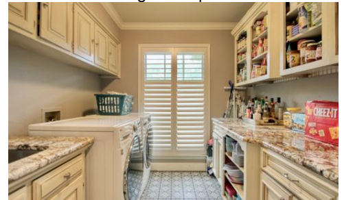
Utility Room with Sink & Pantry