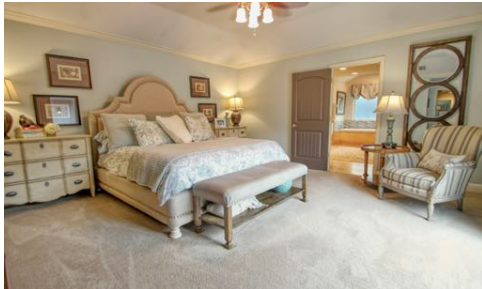
Spacious Primary Suite