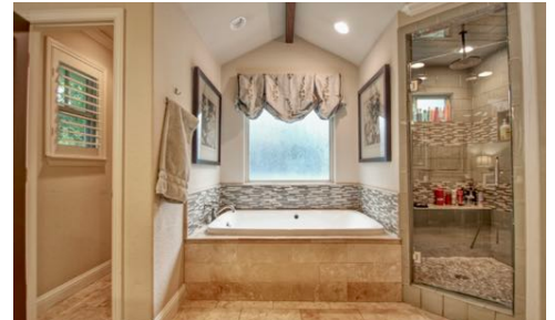
Jetted Tub & Separate Shower