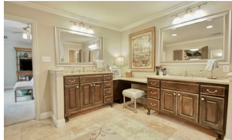
Dual Vanities & Dual Sinks