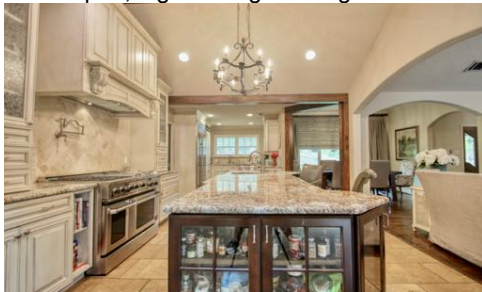
Gourmet Kitchen with Island