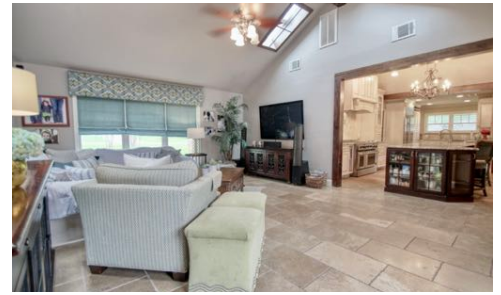
Second Living Area open to Kitchen