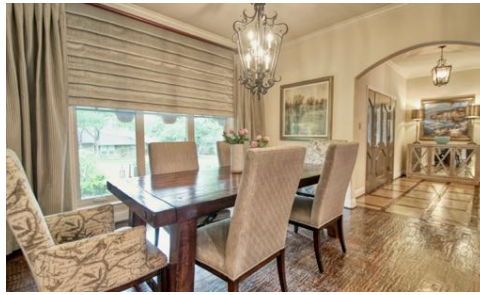
Ample Dining Room off Entry