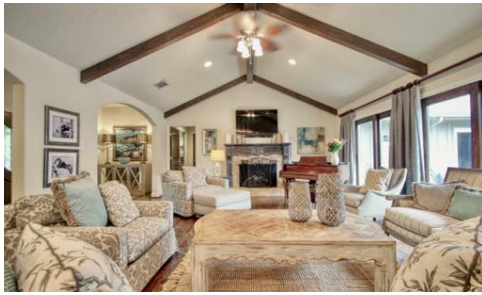
Open, Light & Bright Living Room