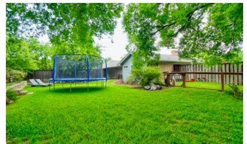
Huge Backyard Space with Partitioned Space for Dogs or even Chickens