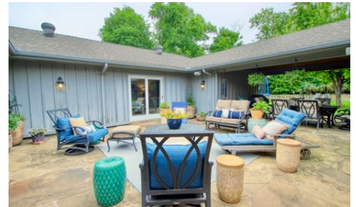
HUGE Entertaining Patio with Fire Pit