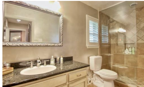
Full Guest Bathroom