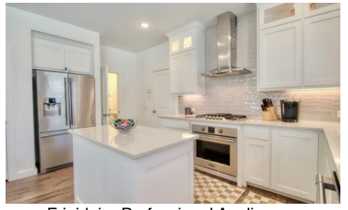
Frigidaire Professional Appliances