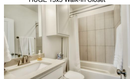
Upstairs Full Bathroom