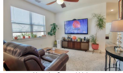
Upstairs Second Living