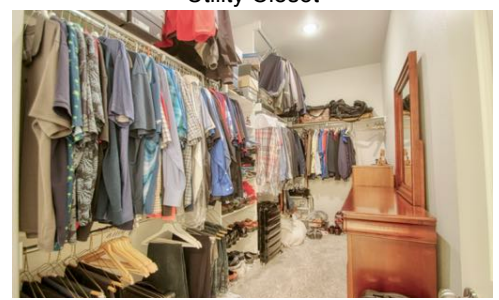
HUGE 15x5 Walk-In Closet