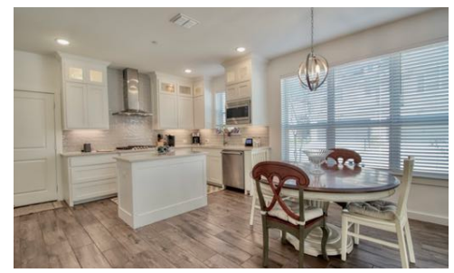
Open & Upgraded Floor Plan