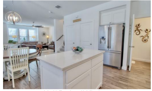
Half Bath off Kitchen