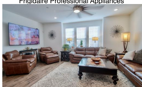
2nd View of Downstairs Living