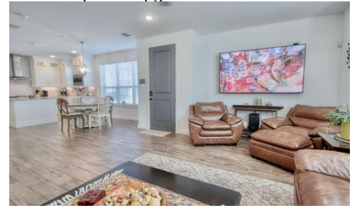
Open, Spacious Living Area