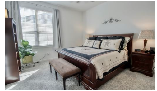
Primary Upstairs Bedroom