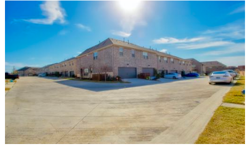
Rear Garage with Ample Guest Parking