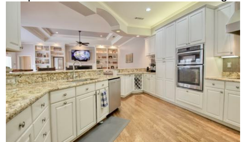
Kitchen Workspace & Open to Living Area