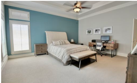
Large Primary Bedroom