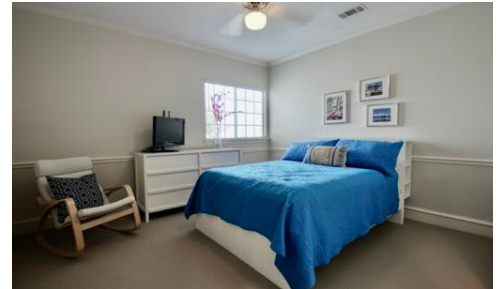
Upstairs Bedroom 3