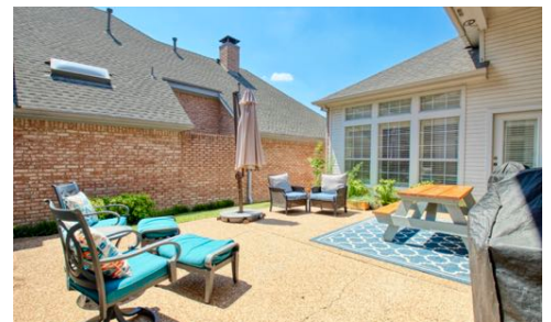
Spacious Patio (partially covered) with Green Space for Fido