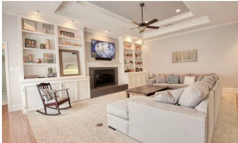
LARGE Living Area with WBFP & Built-Ins