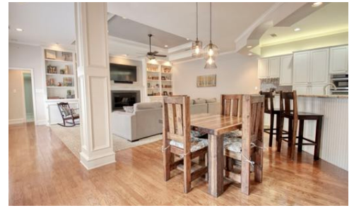
Open Breakfast Area to Kitchen & Living