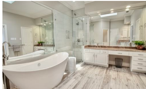
Updated Primary Bathroom