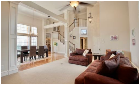
Front Living Area with Tall Ceilings