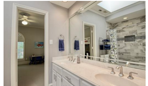
Upstairs Updated Full Bathroom