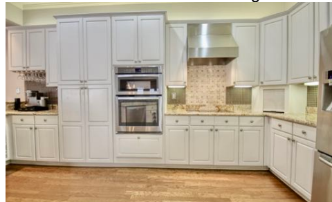
Stainless Appliances & White Cabinets