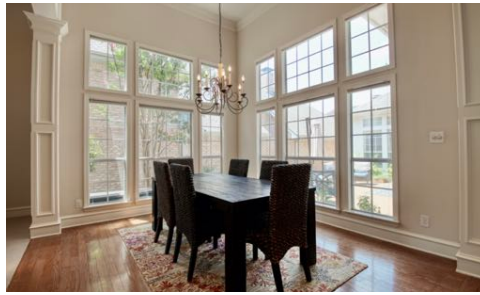
Wall of Windows in the Dining Area