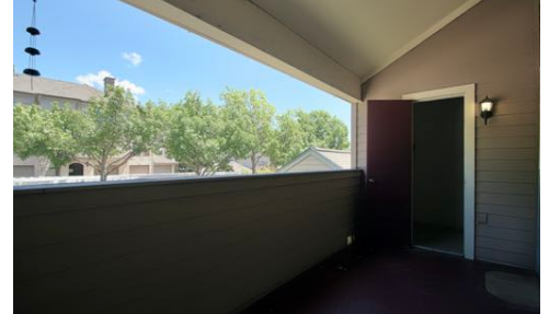
Spacious 13x6 Patio with 6x5 Storage