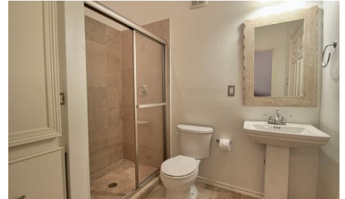
Upstairs Bathroom 2