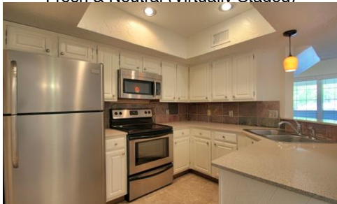
Stainless Appliances & Quartz Counters