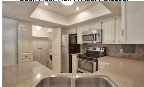
Spacious Utility Room & Storage/Pantry