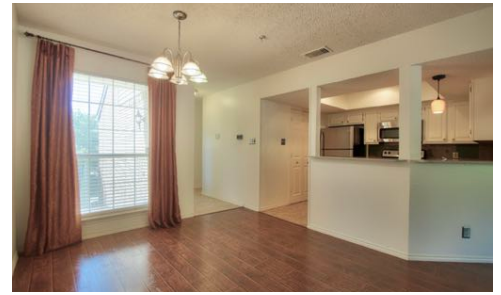
Ample Dining Area with Kitchen Bars