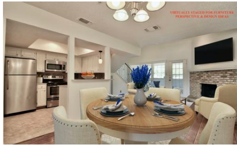
Open Floor Plan (Virtually Staged)