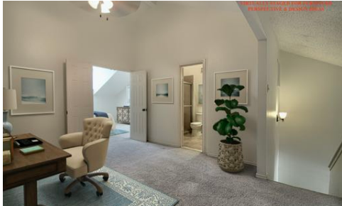
Upstairs 2nd Living Area or Study (Virtually Staged)