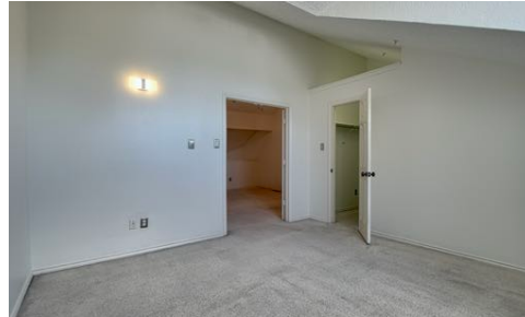
Spacious Bedroom 2 with Walk In Closet