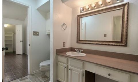
Spacious Vanity & Refinished Tub/Shower