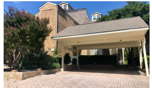
Covered Carport Space #237 with Additional Space behind for Parking