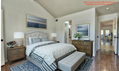
Primary Bedroom Suite (Virtually Staged)