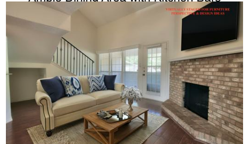
Wood Burning FP (Virtually Staged)