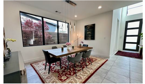
Dramatic Dining Area with Japanese Maple

Living Room/1: 22 x 19 Living Room/Theater/2 : 21 x 9 Formal Dining/1: 16 x 10 Kitchen/1: 21 x 13 Walk-In Pantry/1: 8 x 7 Utility/1: 7 x 6 Primary Bedroom/1: 18 x 15 Primary Bathroom/1: 15 x 13 Primary Closet/1: 14 x 10 Bed 2/Study/Exercise/1: 15 x 14 Bedroom 3/2: 13 x 11 Bedroom 4 /2: 13 x 12 Covered Patio/1: 26 x 11 Balcony/2: 24 x 7 Garage: 21 x 21