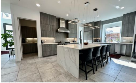
Amazing Kitchen with Finished Pantry