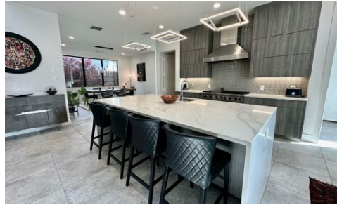
Waterfall Island Perfect for Entertaining