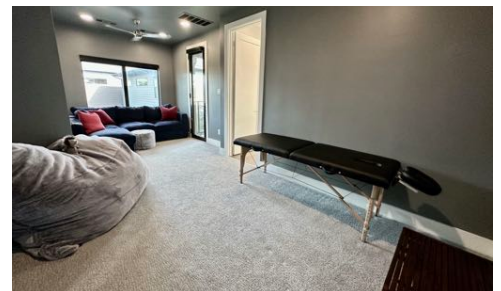
Upstairs Media/Exercise/Bonus Room