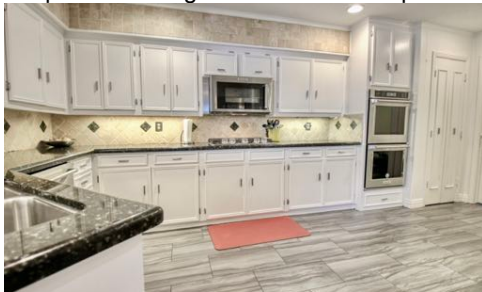
Refreshed Kitchen with Kitchenaid Appls