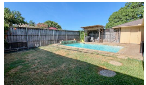
Grassy Backyard with Sparkling Pool & Covered Pergola Space