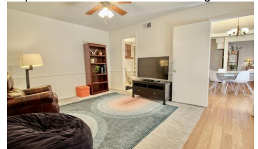
2nd Living w-Full Bath or Optional 5th Bed