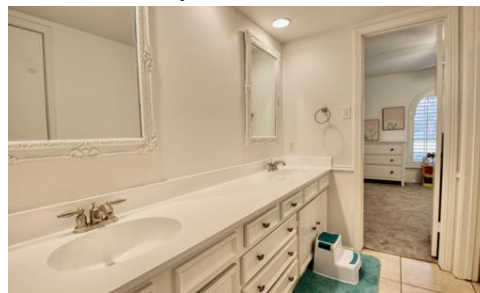
Jack & Jill Bathroom