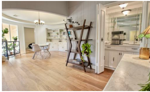
Wet Bar off Living with View of Breakfast