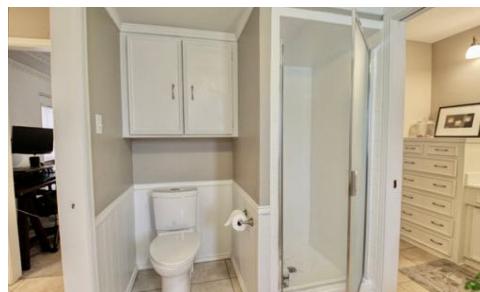
Primary Bathroom View 1