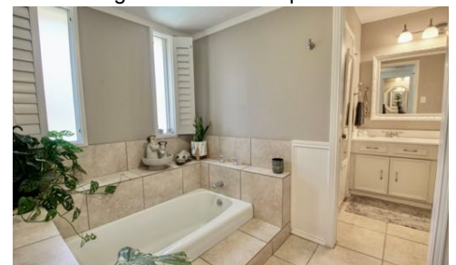
Primary Bathroom View 2