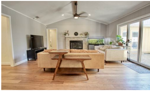
Spacious Living Area with Gas Fireplace