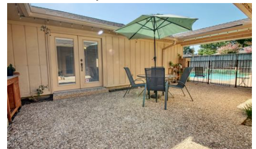
Open Patio in Middle of Home