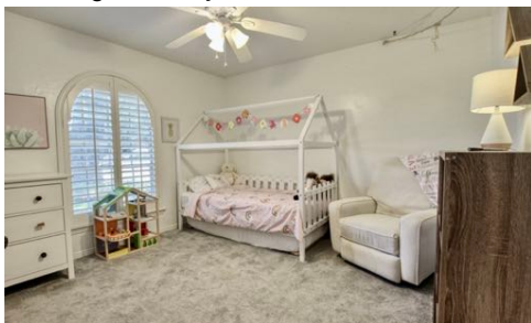
1 of 3 Spacious Additional Bedrooms