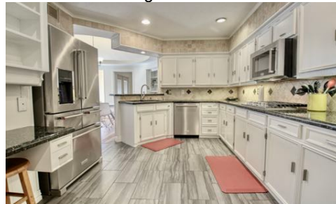
2nd View of Refreshed Kitchen