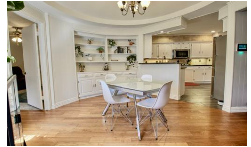
Open Breakfast Area off Both Living Areas