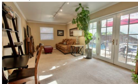
3rd Living Area with Utility Room & 4th Bedroom Adjacent