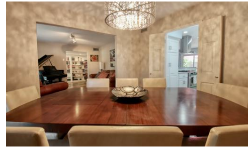
Formal Dining Room off Kitchen & Living