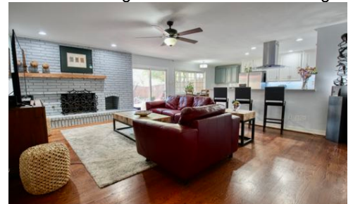
Large Open Living to Kitchen & Breakfast