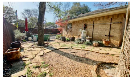
Area for Pets beyond Pool & Patio Spaces