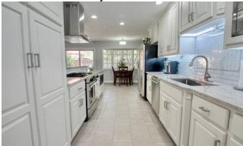
Updated, Open Kitchen with Gas Range