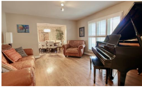
Large Formal Living Room open to Dining