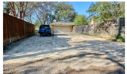
Long Extended Driveway with 3rd Space