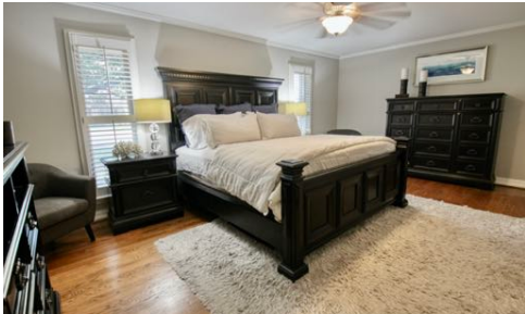
Spacious Primary Bedroom