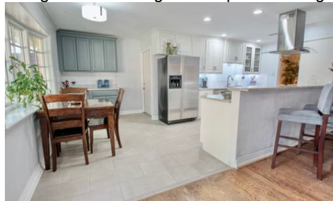
Breakfast Space with Butler Pantry Area