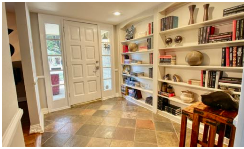
Beautiful Entry with Built-In Shelves