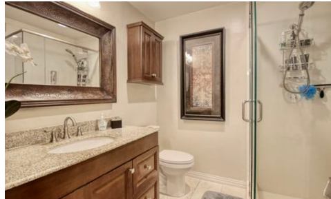
Primary Bathroom with Frameless Glass