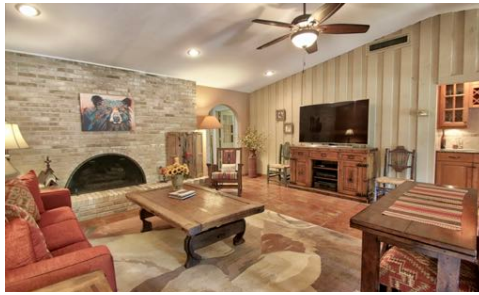
Vaulted Ceiling with Gas Log FP in Living