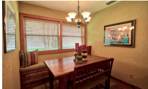
Breakfast Area with Built In Storage Bench