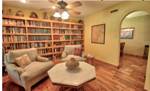
Living 2, Library, Study/Den or Play Room