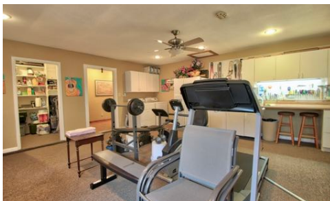
Living Room #4 with Storage & Utility (or convert back to 2 Car Garage)