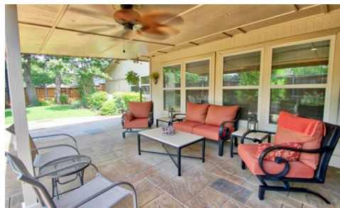
Relax on the Covered Patio over looking the Gorgeous Backyard