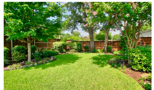
Professionally Landscaped Backyard