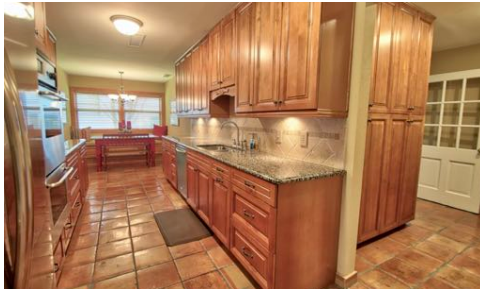
Spacious Kitchen with Pantry/MUD Room