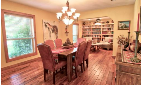
Spacious Formal Dining Room