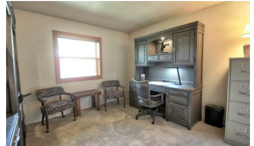
Study or Home Office