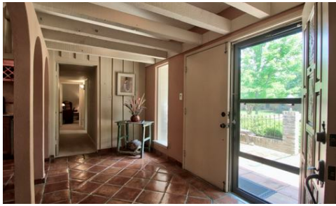
Dramatic Gracious Entry off Courtyard