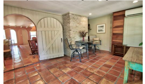
Spacious 3rd Living