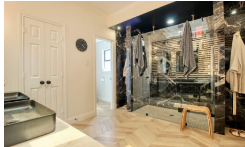
Luxurious Spa-like Primary Bathroom