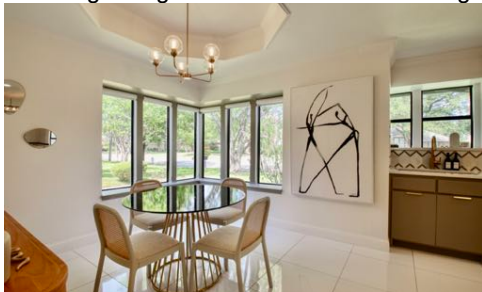
Light Filled Breakfast Area off Kitchen