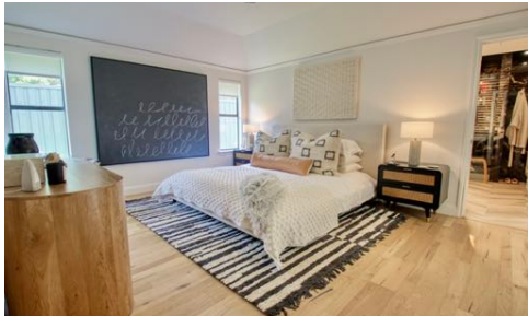
Spacious Primary Suite with Dual Closets