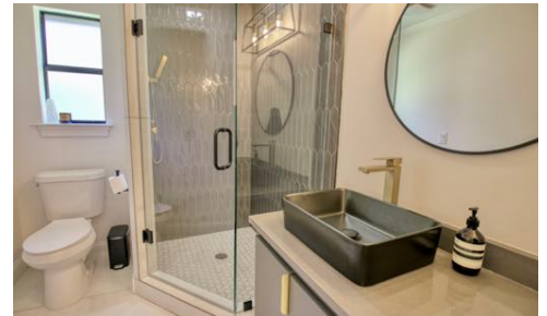
3rd Full Bathroom