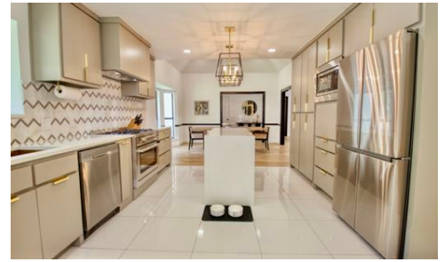
Gorgeous Kitchen with Storage Galore