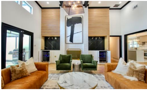
Stunning Living w-Gas FP & Dual Wine Frigs