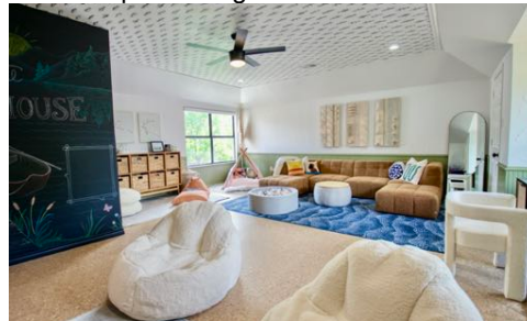
Upstairs 2nd Living or 5th Bedroom