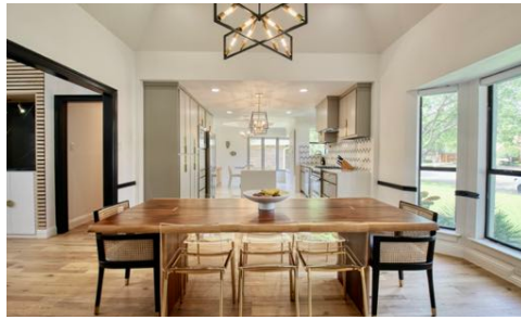
Open Dining Area off Kitchen