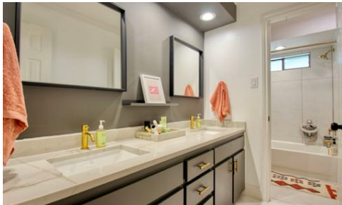
Jack & Jill Bathroom for Beds 2 & 3