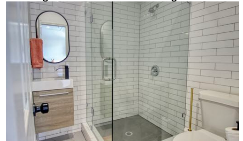
Upstairs Fourth Bathroom