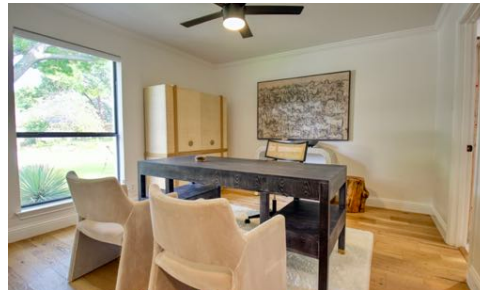
Bedroom 3 makes a Great Home Office