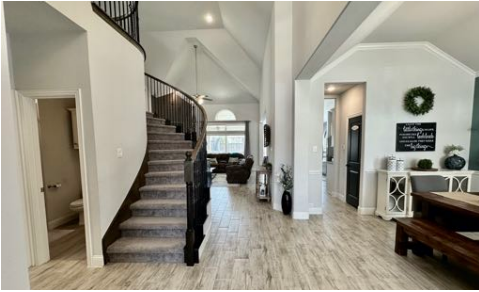
Fabulous, Open & Dramatic Entry