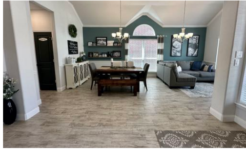
Formal & Living Spaces off of Entry