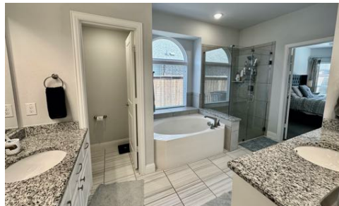
Upgraded Primary Bathroom