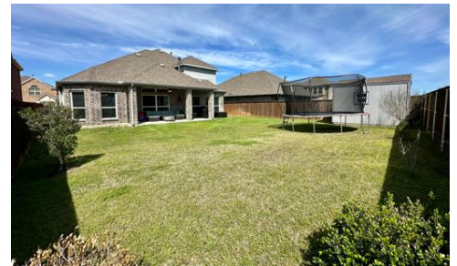
HUGE Backyard with Covered Patio & Shed