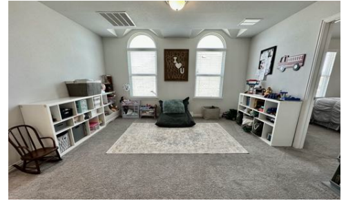
Upstairs 2nd Living Area

Living Room (1st): 18 x 18 Formal Living (1st): 11 x 11 Formal Dining (1st): 11 x 11 Study/5th Bedroom (1st): 12 x 10 Kitchen (1st): 15 x 12 Breakfast (1st): 12 x 10 Primary Bedroom (1st): 17 x 14