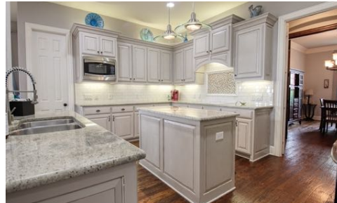
2nd View of Kitchen