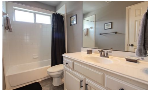
Upstairs Full Bathroom