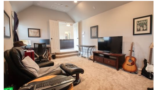
Upstairs Third Living/Media/Gameroom