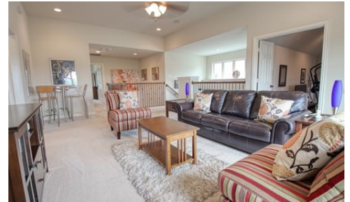
Upstairs Second Living Area