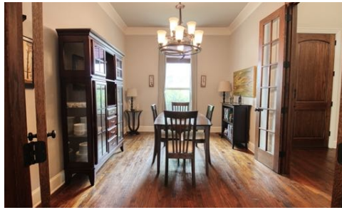
Optional Formal Dining or Study w/ Doors