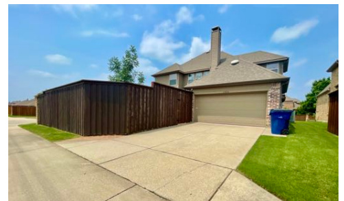
Lengthy Driveway with 3 Car Tandem Garage (2 Wide + 1 Tandem)