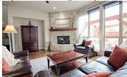
Downstairs Living Room with Gas Log FP