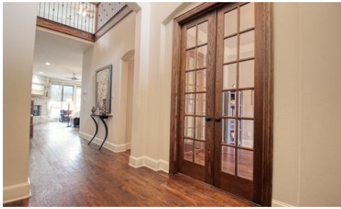
Open Entry Foyer