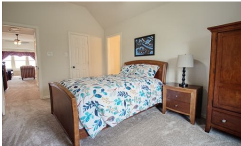
Upstairs Fifth Bedroom