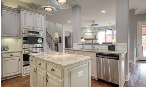
Spacious Open Kitchen with Island