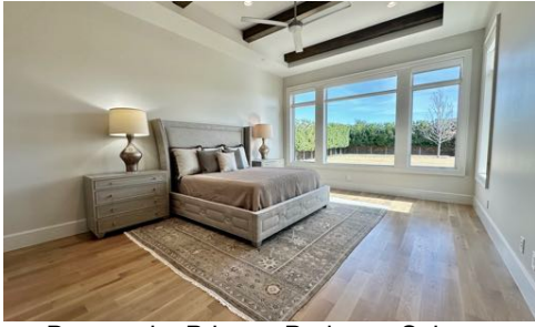
Downstairs Primary Bedroom Suite