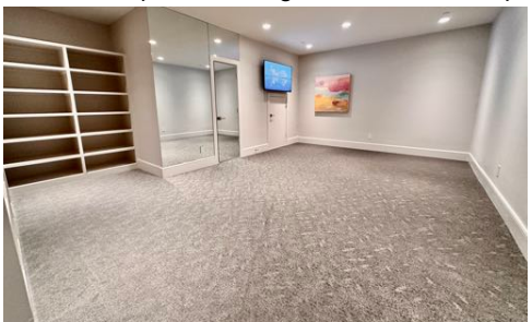
Upstairs Bonus Exercise/Storage Room