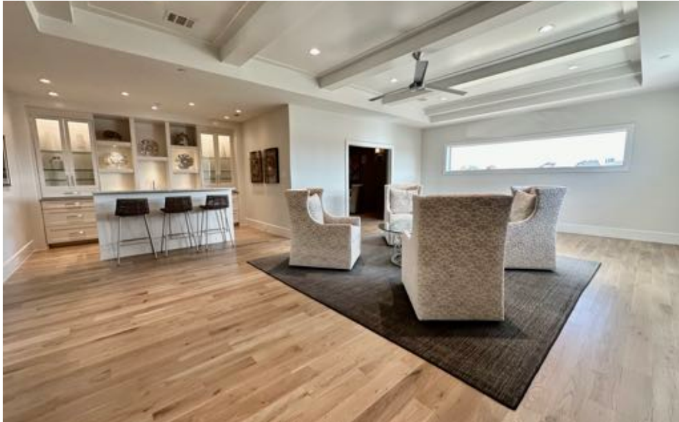
Upstairs Living Area with Bar/Prep Area & Media/Theater Room Adjacent