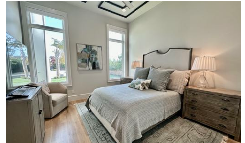
Downstairs Bedroom #2/Guest Suite