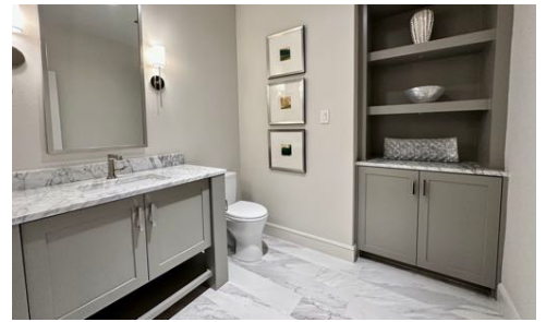
Upstairs Half Bathroom