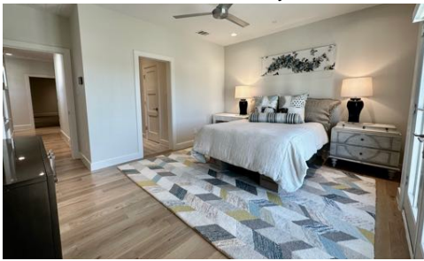
Upstairs Bedroom #4 Suite