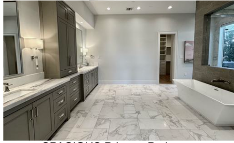
SPACIOUS Primary Bathroom