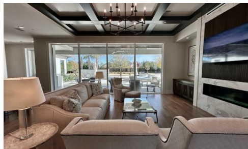
Wall of Windows off the Downstairs Living

First Service Residential (800) 927-4599