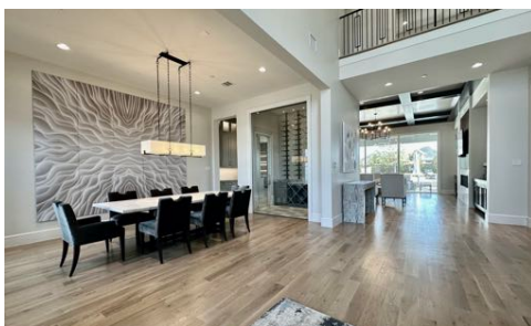
Front Grand Foyer & Formal Dining