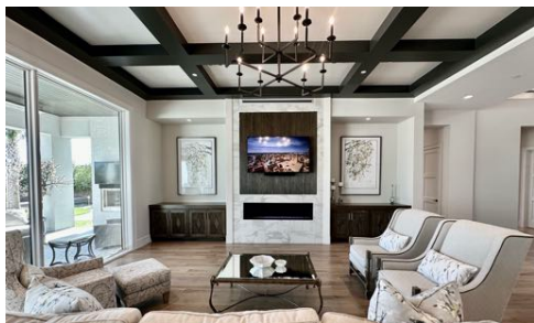
Downstairs Living with Electric Fireplace