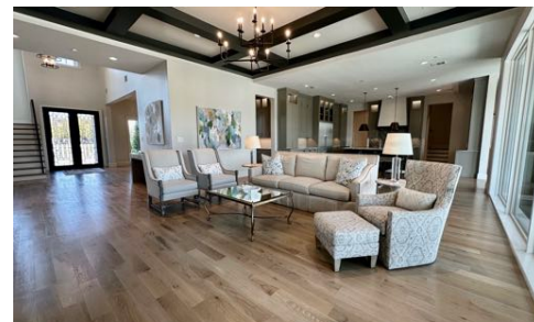
Spacious, Light Filled Floor Plan