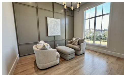
Front Study/Office Area