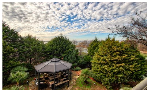
Stunning View from Upstairs Deck