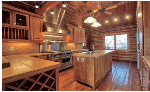
Gourmet Kitchen with Stainless Appliances