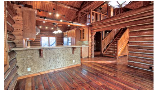
Spacious Dining Area Kitchen Adjacent