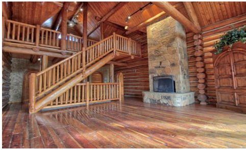
Vaulted, Open Living Area with WBFP