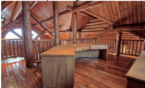
Loft/Study Area with Views of the Lake