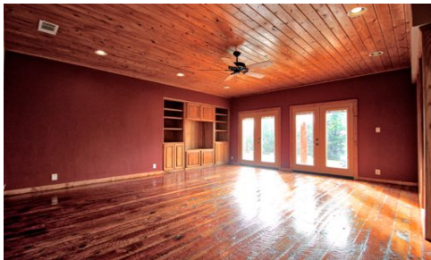
2nd Living Area with Patio/Backyard Access