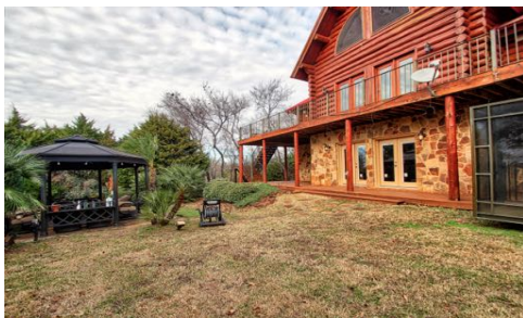
Backyard with Pergola & Patio/Decks