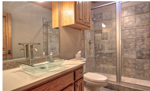
2nd Full Bathroom