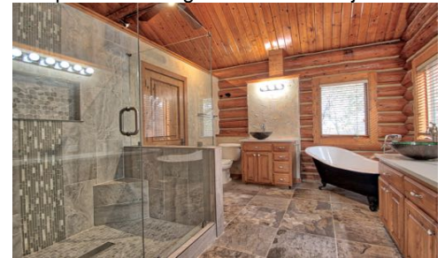
Updated, Spacious Master Bathroom