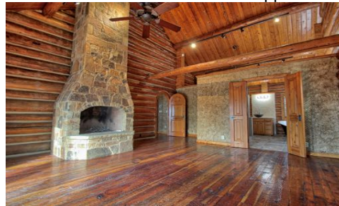
Spacious Master Bedroom with WBFP