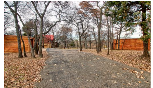
View of 2 & 3 Car Garage Out Buildings