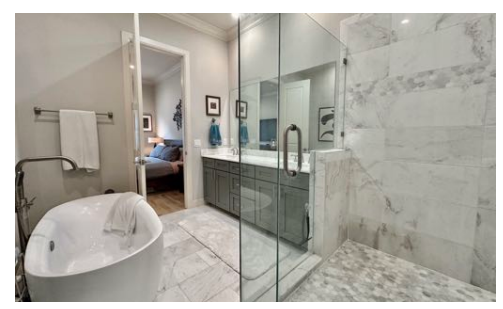
Gorgeous Spa-Like Primary Bathroom