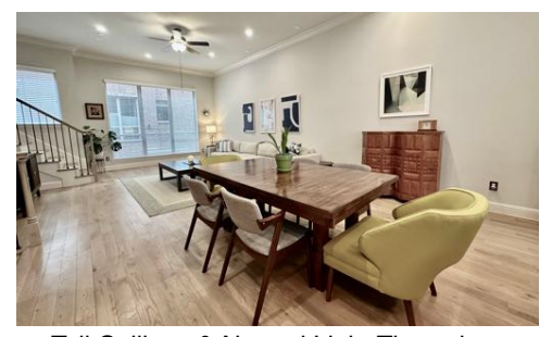
Tall Ceilings & Natural Light Throughout