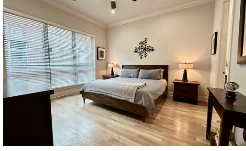
Spacious 3rd Floor Primary Suite