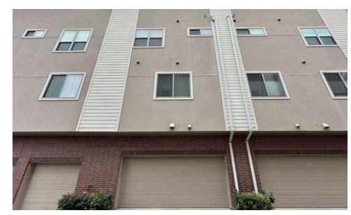
Attached 2 Car Garage