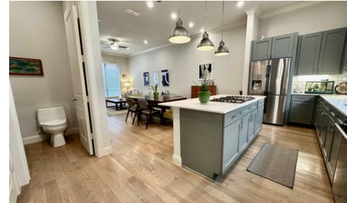
Spacious, Large Kitchen with Half Bath

Living Room (2nd): 18 x 17 Dining Down (2nd): 15 x 10 Kitchen (2nd): 21 x 9 Primary Bedroom (3rd): 14 x 13 Primary Closet (3rd): 10 x 8 Bedroom 2 (3rd): 11 x 10 Bedroom 3 (1st): 14 x 10 Utility Closet (3rd): 6 \times 4 Screened Rooftop Patio: 19 x 17 Garage (1st): 21 x 18