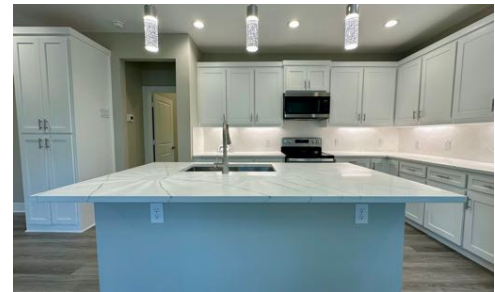
Kitchen Island for Entertaining

Living Room: 16 x 15 15 x 8 Dining: Kitchen: 13 x 11 Utility: 6 \times 3 16 x 13 Primary Bedroom: Primary Bathroom: 13 \times 8 Primary Closet: 13 x 6 Bed 2: 12 x 11 Bedroom 3: 12 x 11 Covered Patio: 12 x 7 20 x 11 Garage: