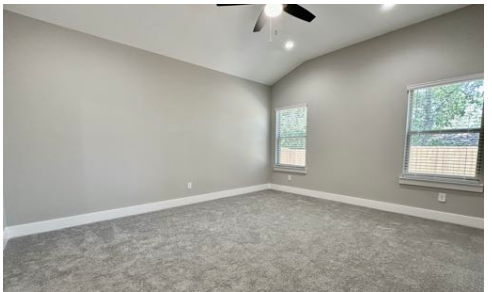
Spacious Primary Bedroom