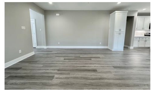
Spacious Living Area with Open Floor Plan