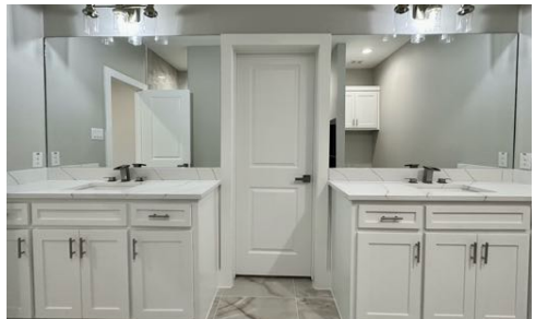
Dual Vanities in Stunning Primary Bathroom

Covered Patio and Grassy Yard to Sit and Entertain or Play Ball with Fido