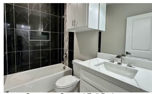
Gorgeous Second Full Bathroom