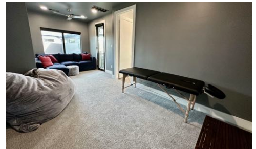
Upstairs Media/Exercise/Bonus Room