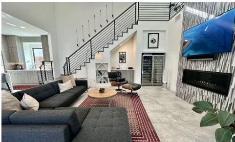
Dry Bar Area below Stairs in Living Room