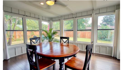
Living Area (or Dining) with Backyard Views