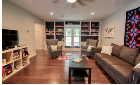
Large Living also with Built-Ins