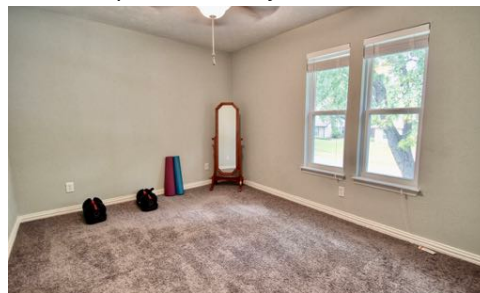
Upstairs 3rd Bedroom