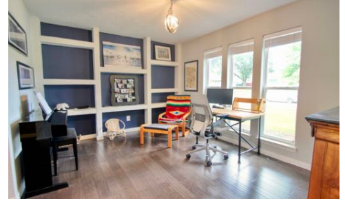
Formal Dining Area (used as Study)