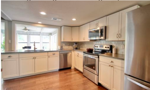
Updated Kitchen with Stainless Appliances