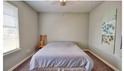
Large Upstairs 2nd Bedroom