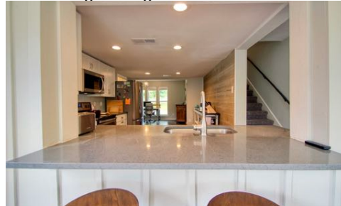
Open Bar Area from Kitchen