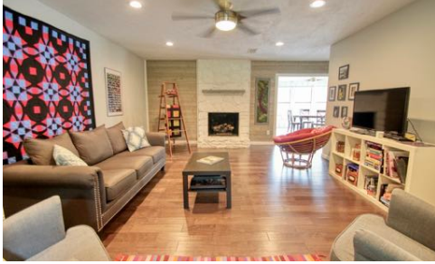
Large Living with Gas Log Fireplace