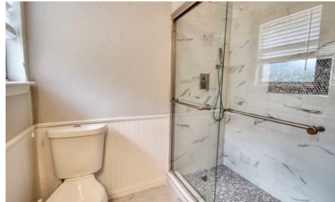
Updated Primary Bathroom