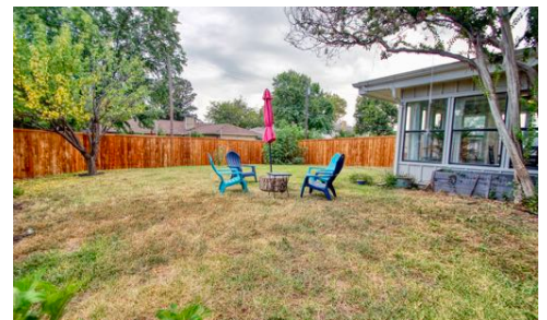
Spacious Interior Corner Lot Backyard