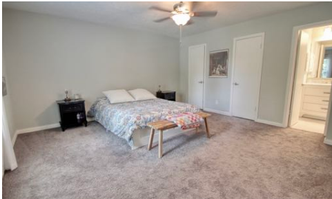
Spacious Upstairs Primary Suite