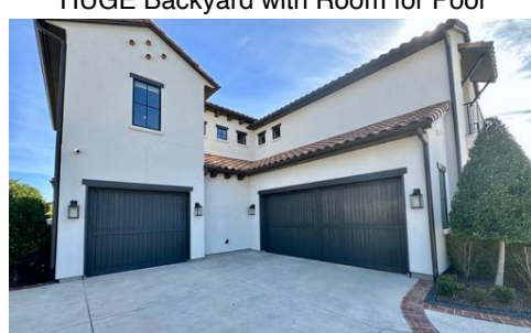
3 Car Garage Spaces