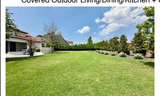
HUGE Backyard with Room for Pool