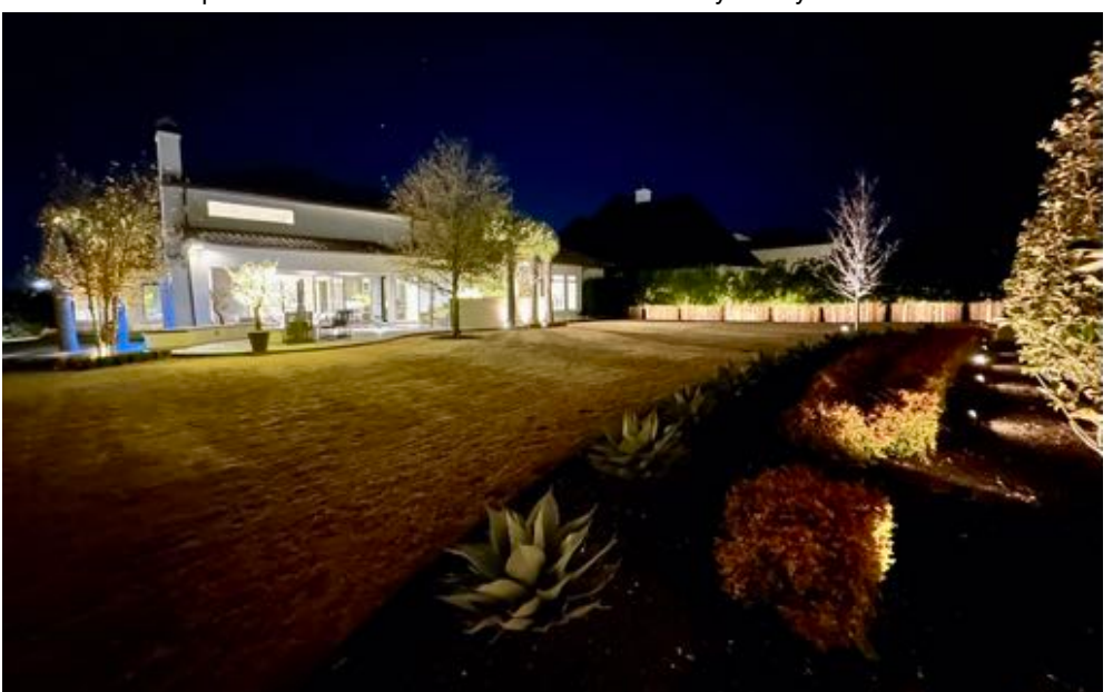
Over $399,900+ in Outdoor Landscaping, Hardscaping & Lighting