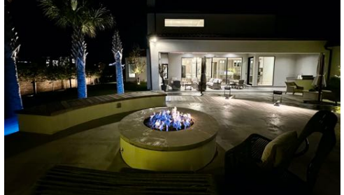
Cozy Backyard Fire Pit Area